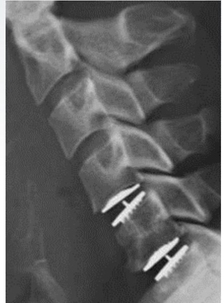
Figure 1. Two-level Mobi-C.

Clinical and radiographic outcomes of 187 Mobi-C patients were collected through 10 years postoperatively to assess the long-term safety and effectiveness of Mobi-C. The 10-year outcomes of the Mobi-C patients were assessed without comparisons to ACDF, as follow-up of the ACDF control group from the IDE study was completed after 7 years of follow-up. 2 The aim of this analysis was to determine whether the statistically significant improvement observed in both 1- and 2-level Mobi-C patients from baseline to 7 years postoperatively was maintained out to 10 years.